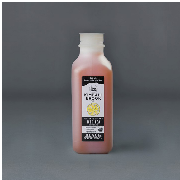
Unsweetened Iced Tea Black with Lemon 6/16oz Simple and refreshing, our Black Tea has a touch of Lemon. Nothing sweet about it. Code: KBF001 Regular Price: $10.50