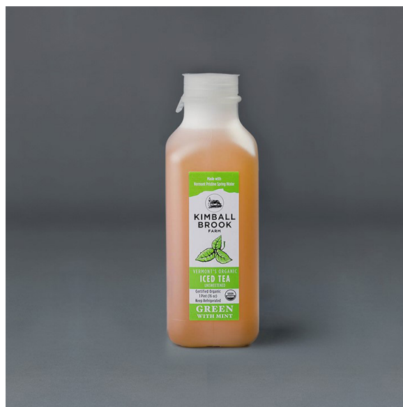
Unsweetened Iced Tea Green Tea with Mint 6/16oz Smooth Green Tea flavor with mint and no sugar. It's just sweet enough on its own. Code: KBF004 Regular Price: $10.50