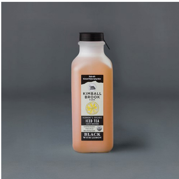
Iced Tea Black with Lemon 6/16oz Our classic Black Tea with a refreshing touch of lemon and a dash of sugar. Code: KBF002 Regular Price: $10.50