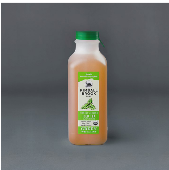
Iced Tea Green Tea with Mint 6/16oz Slightly Sweetened Green Tea with mint to create the ultimate refreshing pick-me-up. Code: KBF003 Regular Price: $10.50